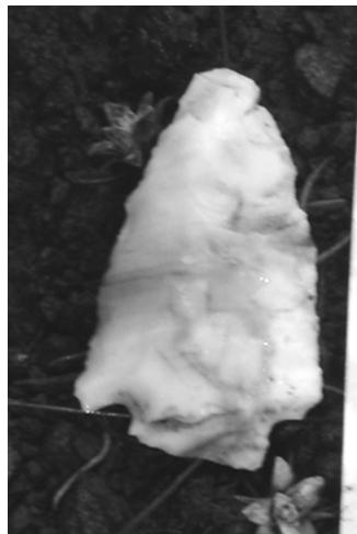
Projectile points (arrowheads) and tools (knives and scrapers)