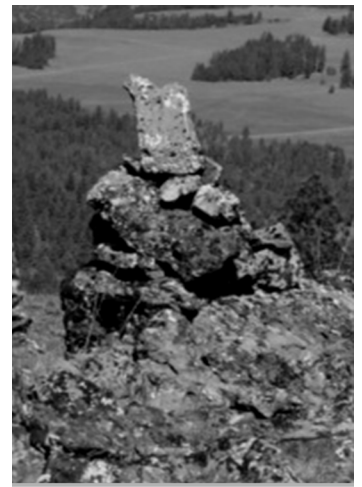
Rock Stack Feature (Cairns, fence lines, fire rings etc)